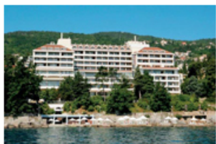
Located in Lovran