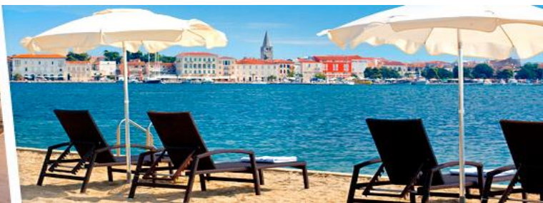
Rooms / Suites