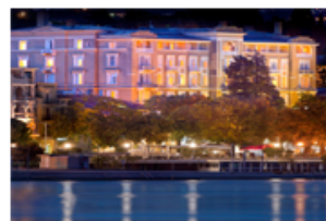
Located in Opatija