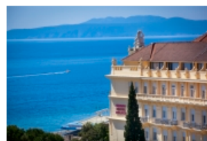
Located in Opatija