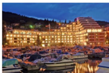
Located in Opatija