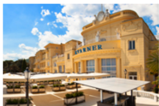
Located in Opatija