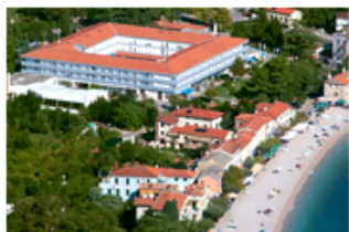
Located in Moscenicka Draga