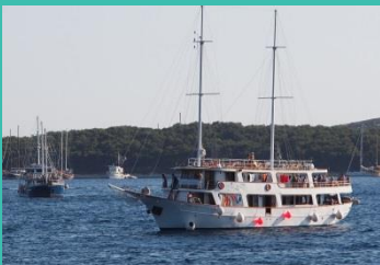
A+ category MV MORENA (ex KAPETAN BOTA II), or similar