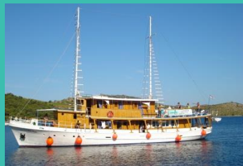
A category MV KALIPSA, or similar